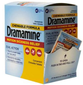
DRAMAMINE 2- PACK 25CT DISPENSER BOX