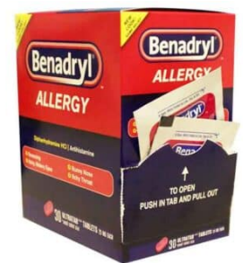
BENADRYL 2-PK DISPENSER BOX