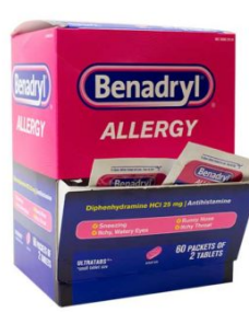
BENADRYL 2-PACK 60CT DISPENSER BOX