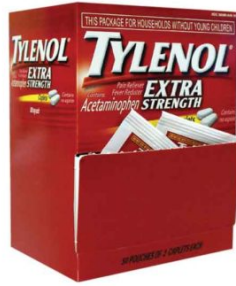
EXTRA STRENGTH TYLENOL 2-PACK 50CT DISPENSER BOX