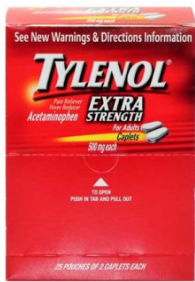
TYLENOL EXTRA STRENGTH 2- CAPLETS DISPENSER BOX