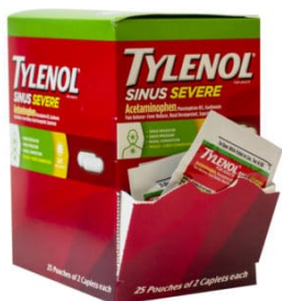
TYLENOL SINUS SEVERE DISPENSER BOX