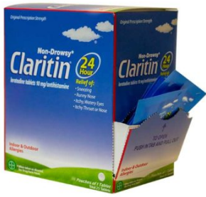
CLARITIN 24HR NON-DROWSY 1- PACK DISPENSER 20 COUNT BOX