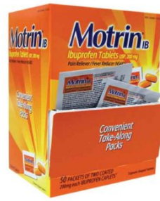
MOTRIN 2-PACK 50CT DISPENSER BOX