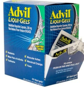
ADVIL LIQUID GELS 2-PACK 25CT DISPENSER BOX