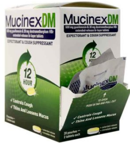
MUCINEX DM 2- PACK 20CT DISPENSER BOX