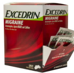
EXCEDRIN MIGRAINE 2-PACK 25CT DISPENSER BOX