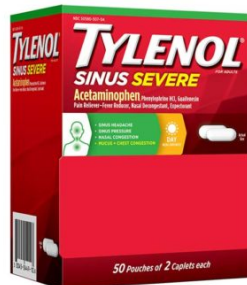
TYLENOL SINUS SEVERE 2-PACK 50CT DISPENSER BOX