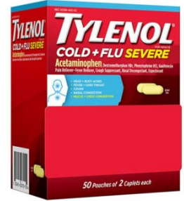
TYLENOL COLD & FLU SEVERE 2-PACK 50CT DISPENSER BOX