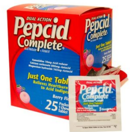
PEPCID COMPLETE 1-PACK BERRY CHEWABLES