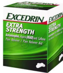
EXCEDRIN 2-PACK 25CT DISPENSER BOX