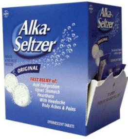
ALKA SELTZER 2-PACK 50CT DISPENSER BOX