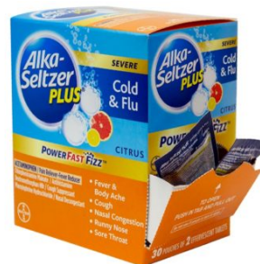
ALKA SELTZER PLUS 2-PACK 30CT DISPENSER BOX