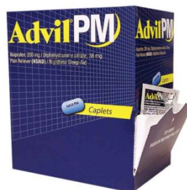
ADVIL PM 2-PACK 30CT DISPENSER BOX