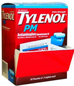
TYLENOL PM 2-PACK 50CT DISPENSER BOX